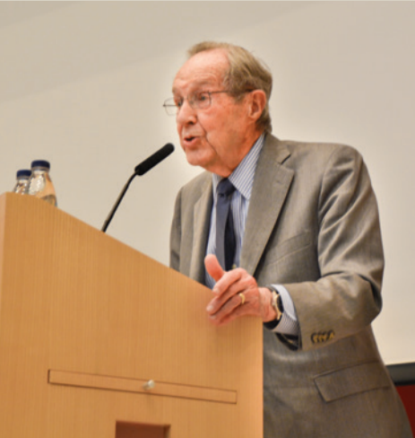
William Perry speaking in March 2016 about My Journey at the Nuclear Brink

Whether it was a discussion on clean energy by Nobel Laureate and former Secretary of Energy, Steven Chu, a conference on sustainable development with Los Angeles Mayor Eric Garcetti and the C-40 or talks about Vladimir Putin by former U.S. Ambassador to Russia, Michael McFaul, the last five years at SCPKU fostered active conversation around the intersection of humanity and technology. During her 2015 address, former Secretary of State Condoleezza Rice reminded us how "technology is the application of knowledge to a problem... it's really a question of where we can marry human potential to technological possibilities to solve our problems".