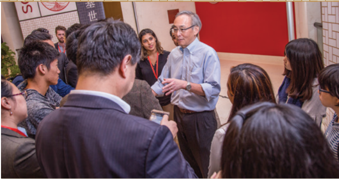
Steven Chu, 2016 Lee Shau Kee World Leaders Forum

Collaboration is also vital in addressing global security, as both Admiral Harry Harris, Commander, U.S. Pacific Command, and Admiral Scott Swift, Commander, U.S. Pacific Fleet, noted in their remarks about sustained military cooperation between China and the United States.