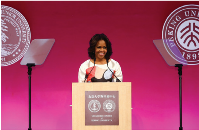
First Lady Michelle Obama's only public address during her China visit, March 2014

Global citizenship and the importance of being interconnected with people and cultures through education and immersion lies at the core of SCPKU's global dialog. At her 2014 SCPKU visit, First Lady Michelle Obama emphasized the importance of global education and the critical role study abroad programs play in enabling students to realize that countries all have a stake in each other's success and are a "vital part of our foreign policy." United States (U.S.) Ambassador to China, Max Baucus, in introducing the First Lady, stated that his study abroad experience "turned his life around."