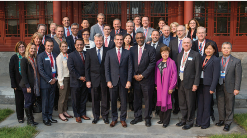
Los Angeles Mayor Eric Garcetti and delegation with U.S. Ambassador Max Baucus, 2014

We strive to raise public understanding of the complex issues facing China and other countries, as they and the world change, through a forum where people come together to test and learn, refine, and further test solutions to advance our progress across global challenges.