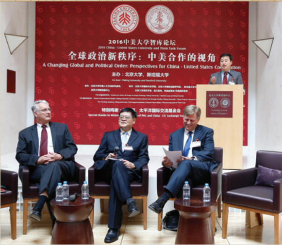
Thomas Fingar, Wang Jisi, Michael McFaul at A CHANGING GLOBAL AND POLITICAL ORDER conference, June 2016

We strive to raise public understanding of the complex issues facing China and other countries, as they and the world change, through a forum where people come together to test and learn, refine, and further test solutions to advance our progress across global challenges.